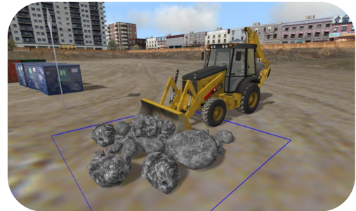
Dumping material on dumping zone with loader bucket