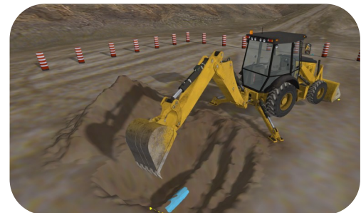
Exposing a buried utility with the backhoe bucket