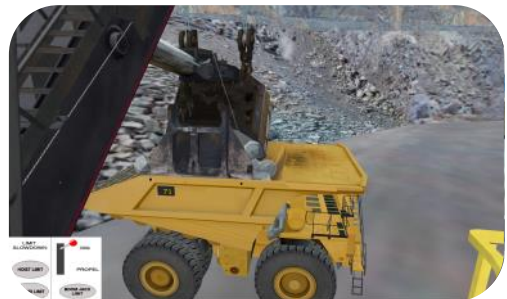
Positioning under full-load conditions for dumping into a Mining Truck