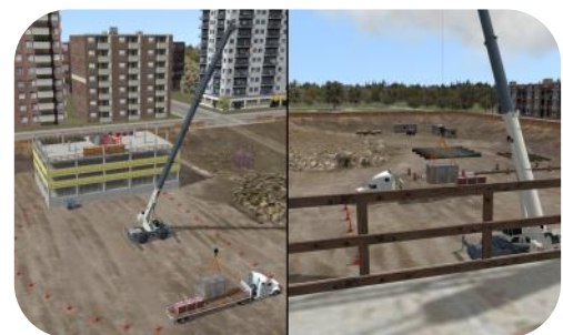
Signal Person Views

A fixed view of the lift area, with the crane, load and target visible. A dynamic view that follows the movement of the load.