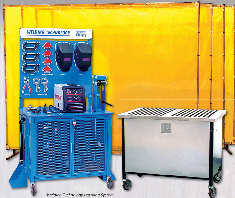
Welding Technology Learning System (950-WT1)