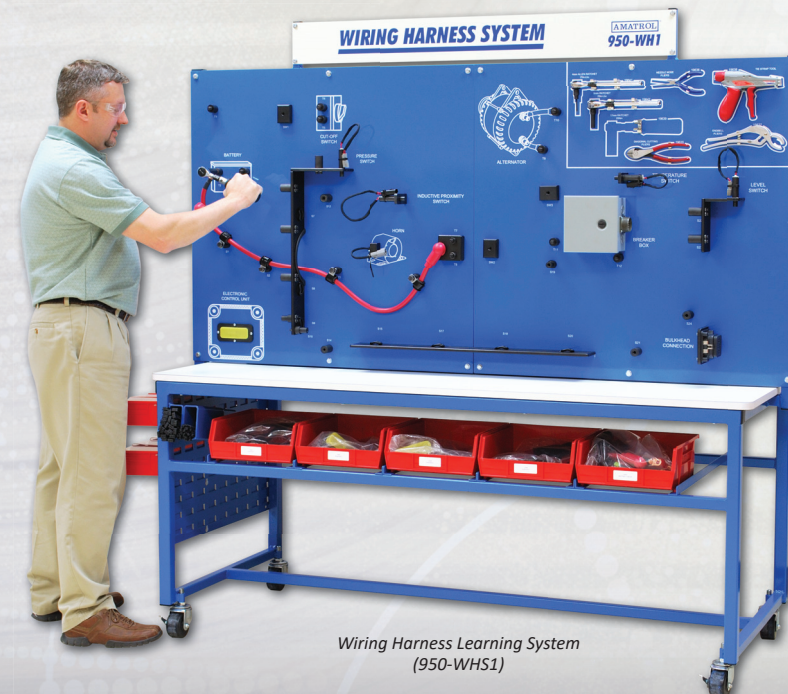
Wiring Harness Learning System (950-WHS1)