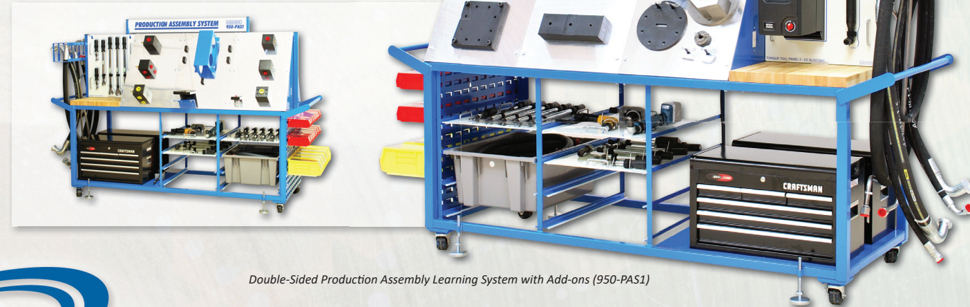
Double-Sided Production Assembly Learning System with Add-ons (950-PAS1)