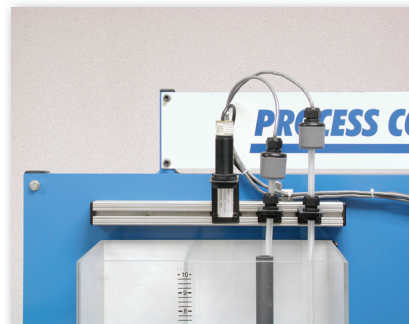
T5552-L1 on T5552 Process Control Learning System

This transducer conveniently mounts to an adjustable slide on the T5552-L1 workstation console above a process tank and is prewired to plug-in connections on the control panel for easy interface to controllers and display devices. The T5552-L1 includes an industrial quality transducer with 4-40 inch sensing range, built-in transmitter with 4-20 mA output, and student learning materials for theory and lab.